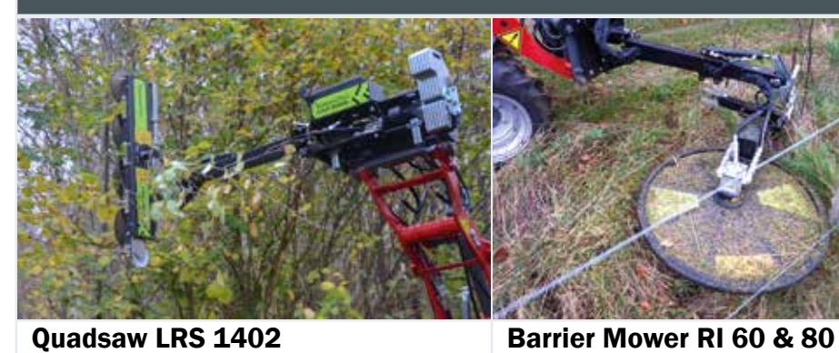
Quadsaw LRS 1402