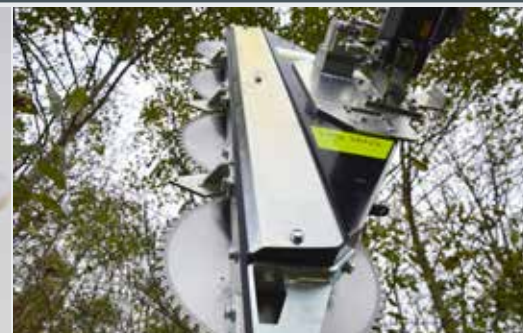
Quadsaw LRS 1602