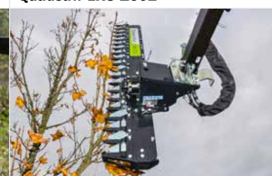
Cutterbar HS 172