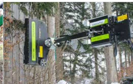
Rotary Hedge Cutter RC 132